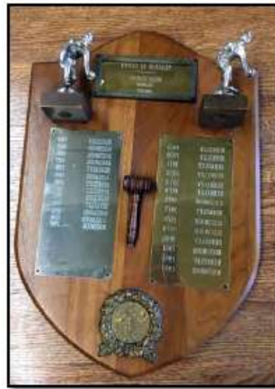
Rossmore-Berkeley Challenge Trophy