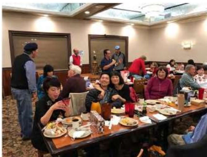
ABC Christmas Party