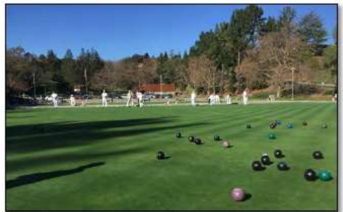
Bowling at Rossmore