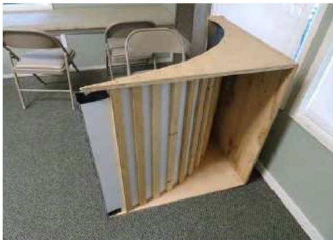
Practice ramp construction.