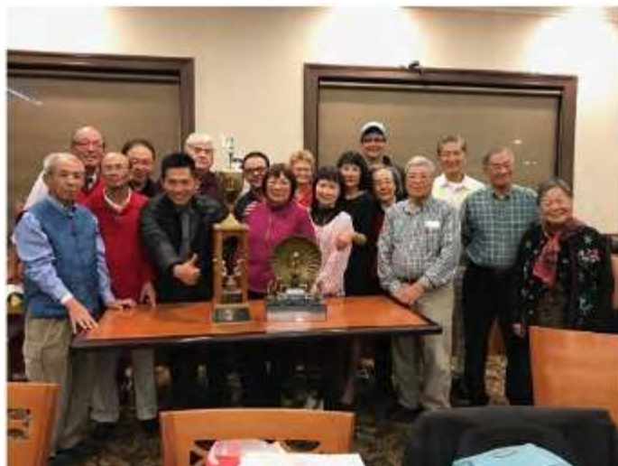
ABC club members with trophies won in 2016; the Valley League and The Waterbury.