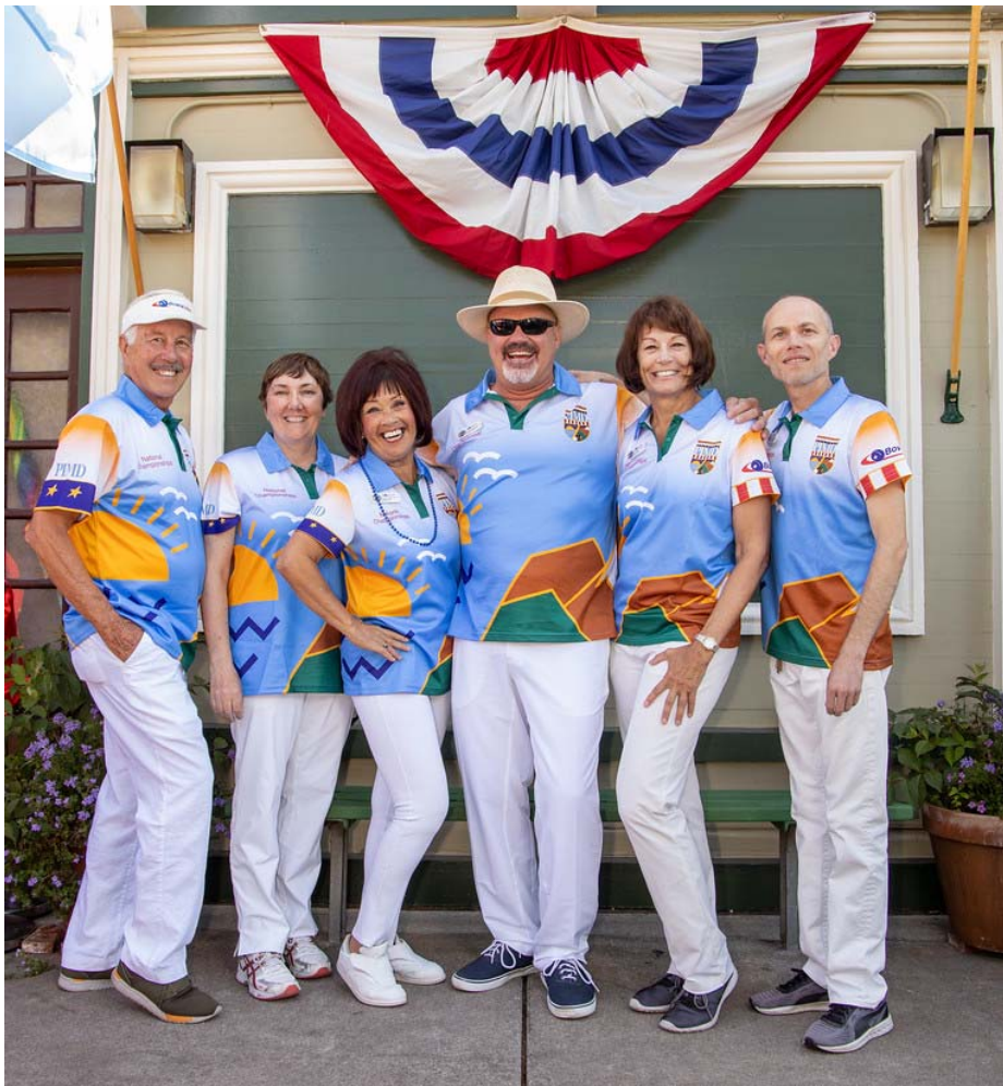
“Bowls by the Bay”