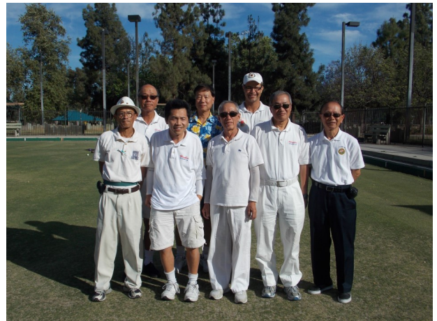
Valley League Champions

Alhambra Bowls Club won Valley League for the Southwest Division's Central District 2015. As such, ABC will represent the Central District at the Waterbury Tournament in October where the winners of league play from all seven districts in the Southwest Division compete for the top prize. Ten ABC members participated this year in Valley League play. Congratulations ABC!