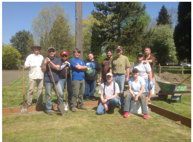
The Portland LBC work crew taking a break from putting in new plinth and backboards.

Portland is now ready to add yet another BFB league as they start the 2015 season anticipating another year of growth.