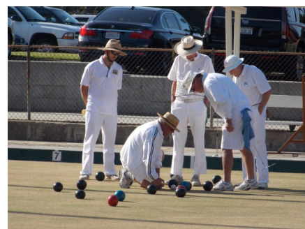
Time to measure.