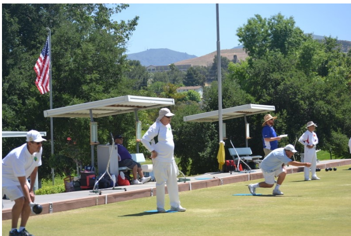
Players in action

It started as a cool morning, but soon progressed into quite a warm afternoon. The participants enjoyed the breakfast and lunch provided by Carol Cox and her able assistants.