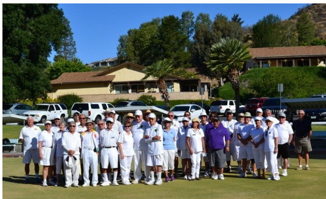
Group photo at Friendly Valley - 18 April 2015

Fourteen teams from nine different clubs participated in the 2015 Mix/Match Doubles Tournament at Friendly Valley in Santa Clarita on Saturday 18 April. Teams from Alhambra, Friendly Valley, Hermosa Beach, Long Beach, Holmby Park, Oxnard, Santa Barbara, Santa Monica, and Sun City took part.