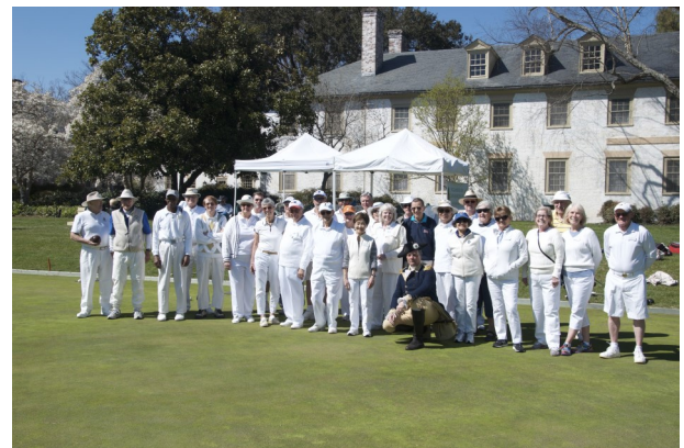
WILBC Members Opening Day

If visiting Williamsburg, please check out our club website at williamsburglawnbowling.org/ . You may also contact us directly if you are in town and we will be very happy to host a friendly game of bowls. We have an abundance of club bowls available for your use and there is no charge for visiting