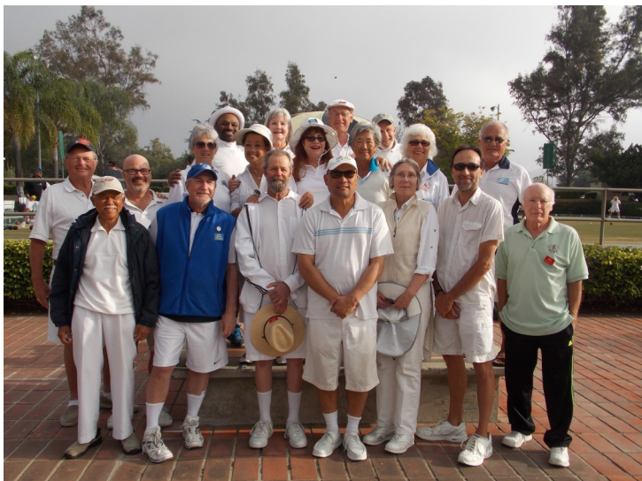
PIMD had 20 participants at the Southwest Open