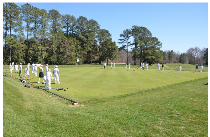
Opening Day on the Green