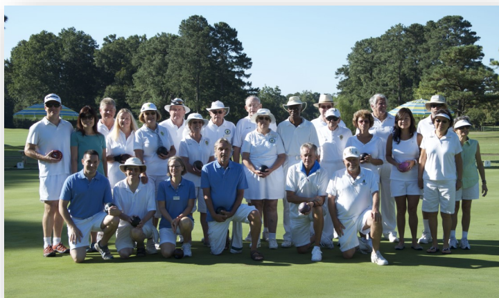
Bowlers participating in the Northeast Open