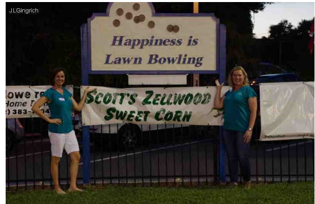
Sweet corn for the Bowling Blast dinner