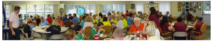
Bowling Blast Dinner