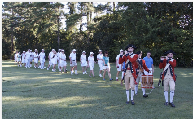
Fife & Drum Corps lead bowlers onto the green.