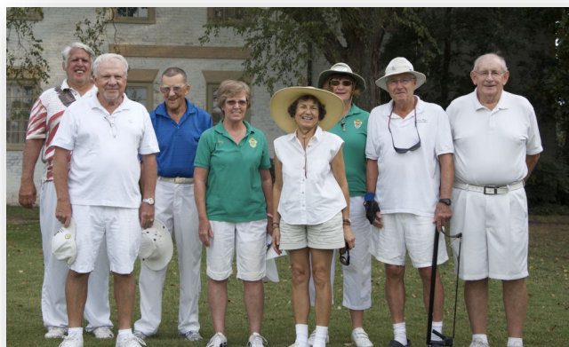
Open Singles Competitors